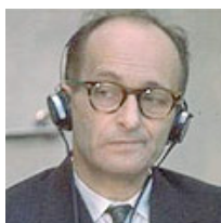
Eichmann during his trial in Israel