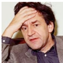
French Jewish philosopher, Alain Finkelkraut